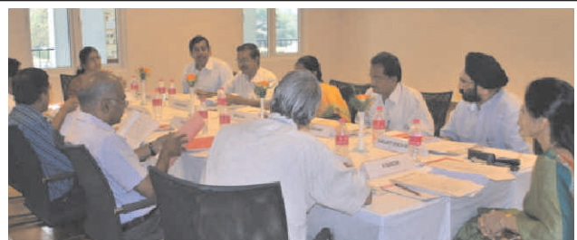
Meeting of the Academic Advisory Body on 6th March 2010

The meeting of the Governing Council of GRGSMS and GRGSACT was held on 24th March 2010.