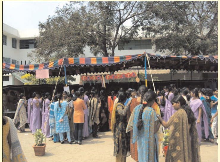
A part of the show of Feb Fiesta – Food Fiesta show

Students of Environment Forum organized a Tableau competition on 4th August, 2010 on the current topics of saving our environment.