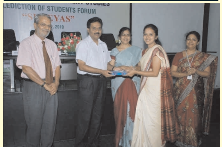
Students were awarded during Valediction of 'Shreyas'