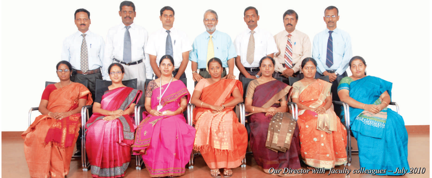
Our Director with faculty colleagues – July 2010