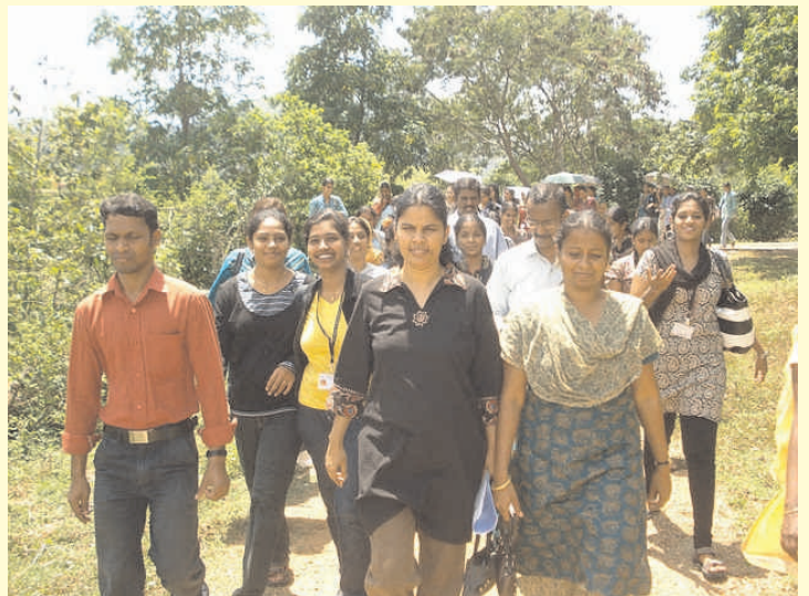
Students and faculty heading towards the forest at the Salim Ali Centre for Ornithology and Natural History on 23rd July 2010